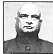
Lt. Governor राज्यपाल Union Territory of Ladakh केंद्रीय शासित प्रदेश लद्दाख

75th Azadi Ka Amrit Mahotsav Radha Krishan Mathur राधा कृष्ण माथुर