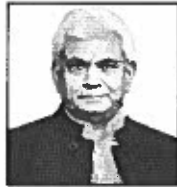
Raj Bhavan Jammu-180001

75th Azadi Ka Amrit Mahotsav Lieutenant Governor Jammu & Kashmir