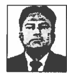
Commissioner/Secretary to Government Election Department Government of Jammu and Kashmir